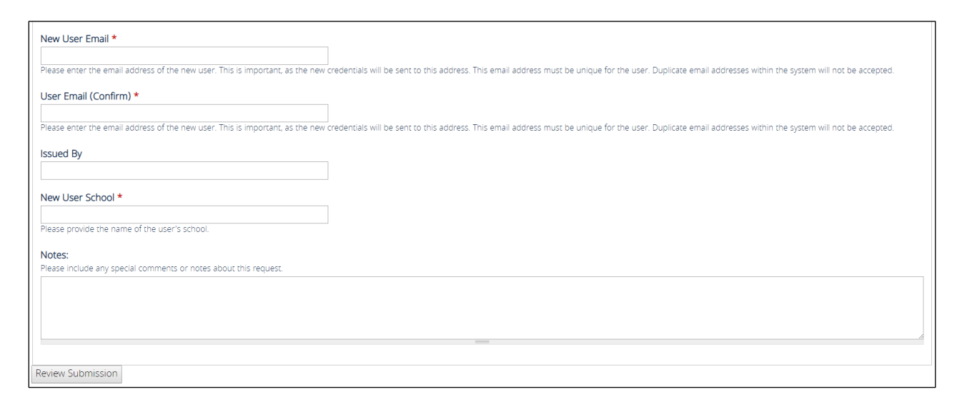
The Create AVL Account window

3. On the Create AVL Account form, enter the student's e-mail address and confirm it. Note: An e-mail address is required to create an AVL account. Next, select the student's school from the School dropdown.